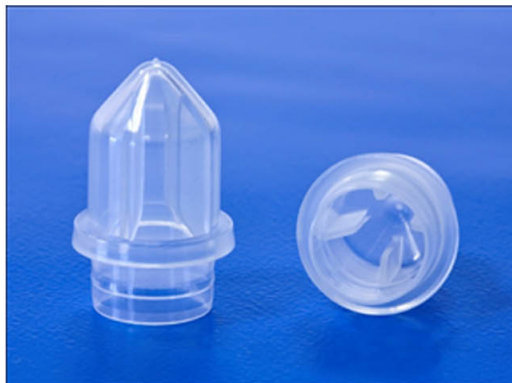
Figure 2: Spin+Collect™

The Spin+Collect™ (Figure 2) has 4 internal fins to expose the maximum surface area of the swab whilst the sample is being eluted from the swab. Furthermore, the fins grip the swab tightly so that the swab is removed together with the vessel in a single rapid step (Figure 3).